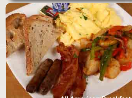
All American Breakfast

Huevos Rancheros Burrito $10.95 A soft tortilla stuffed with scrambled eggs, green bell peppers, red onions, chopped tomatoes, jalapeños, and cheddar cheese. Served with side of potatoes and fresh salsa.