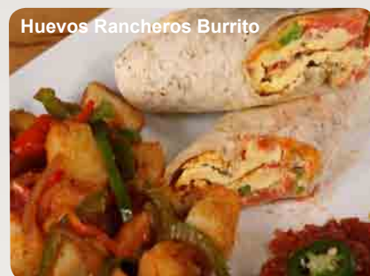
Huevos Rancheros Burrito

Tropical Pancake $10.95 Hot pancake smothered in fresh mixed fruits topped with whipped cream